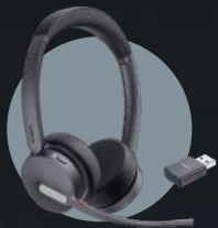
WH64 Hybrid Dual Teams/UC