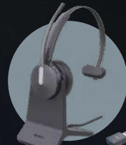
WH64 Hybrid Mono with Charging Stand Teams