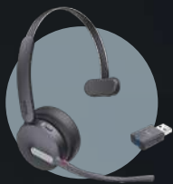
WH64 Hybrid Mono Teams/UC