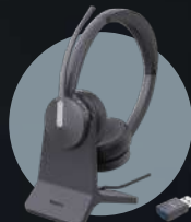
WH64 Hybrid Dual with Charging Stand Teams